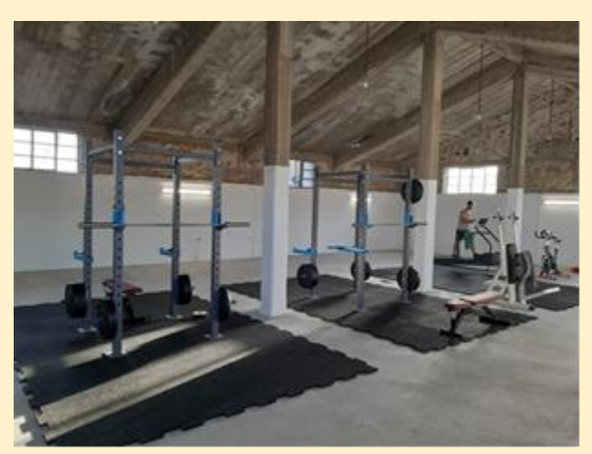
The interior of the indoor sport gym

Today we will give you information about the warehouse of the former Cooperative, which we envision to function in the future not only as sports gym, but also as hall for various sports events, social gatherings and of course as the Club's sports equipment store.