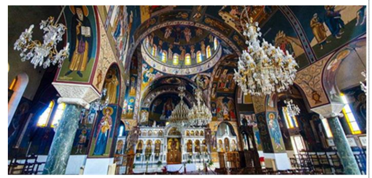
The interior of St Andrew Cathedral